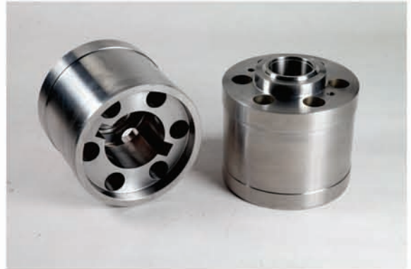
Mfg. & Coated Guide bush of ST.