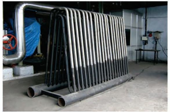
Coated Bottom of Bed Coil