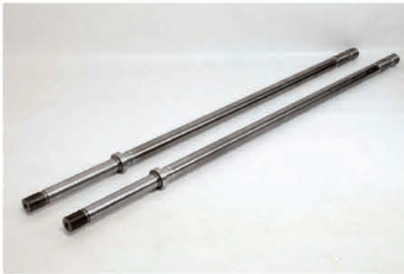
Mfg. & Coated Piston Rod