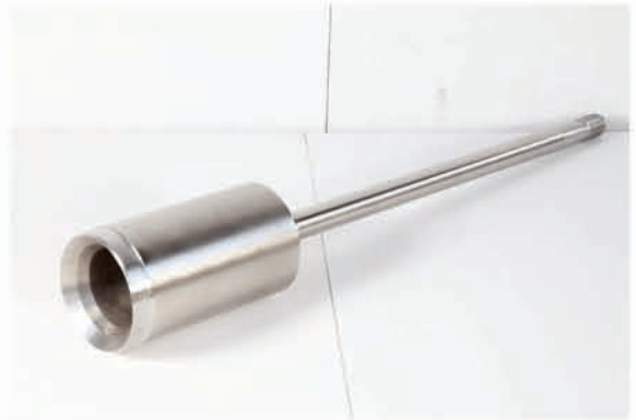
Mfg. & Coated Valve Spindle Cone of ST.