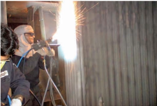
ARC Spray Coating on Water Wall Area