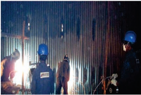
ARC Spray by Dual Coating System