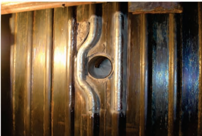
Coated Soot Blower Area