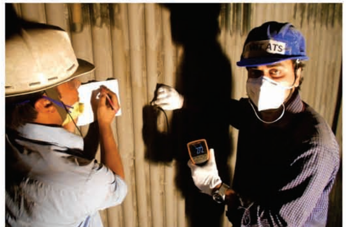
Checking of Coating Thickness