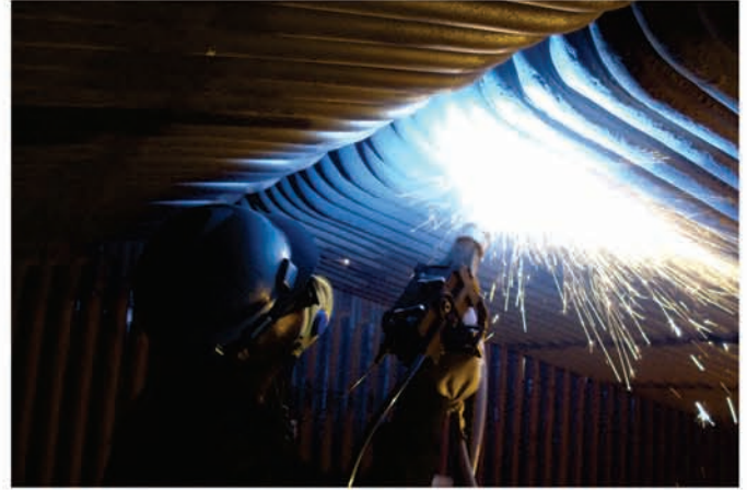
ARC Spray Coating on Top Roof