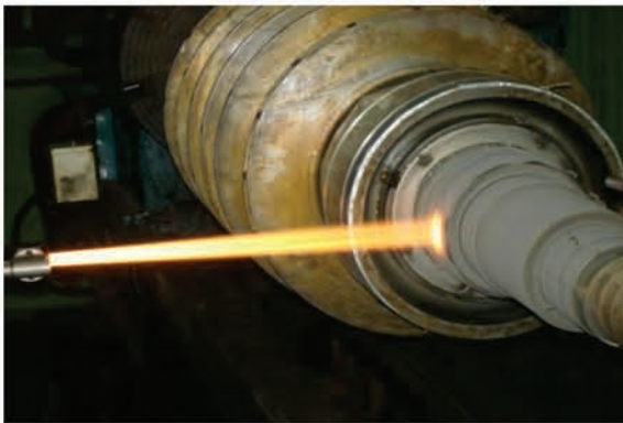
Coating on Compressor Rotor