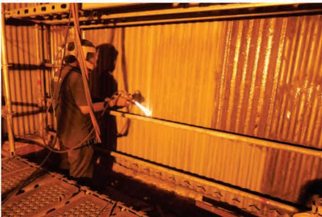
HVOF Coating on Water Wall Area