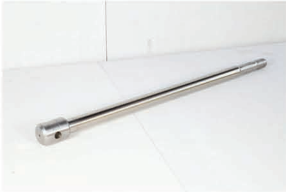
Mfg. & Coated Valve spindle of ST.