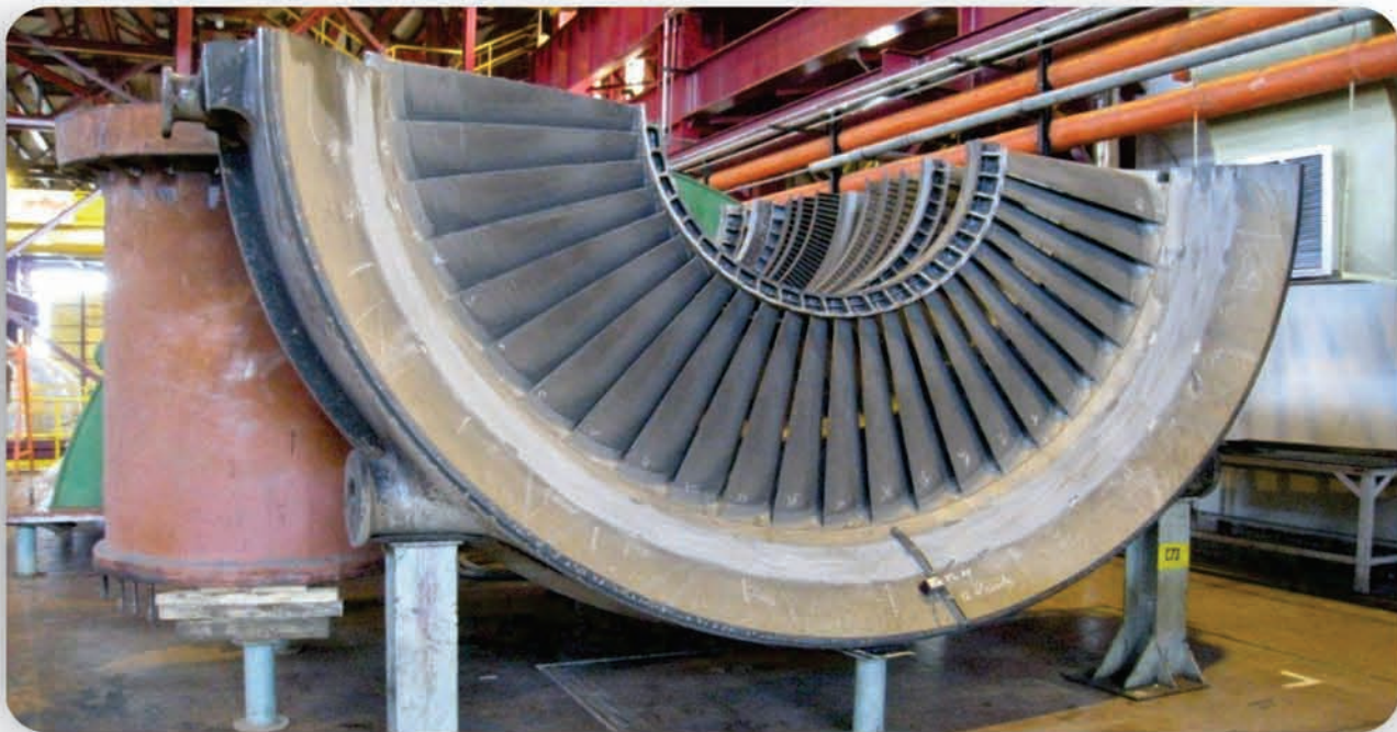
Coated LPT Inner Casing of Steam Turbine