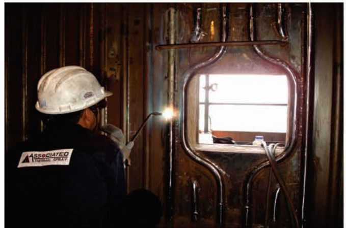
Coating on Top of Economizer