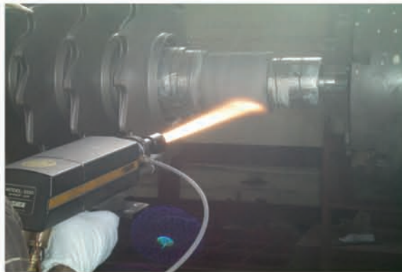
Coating on Steam Turbine Rotor