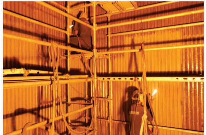
HVOF Coating by Dual Coating System