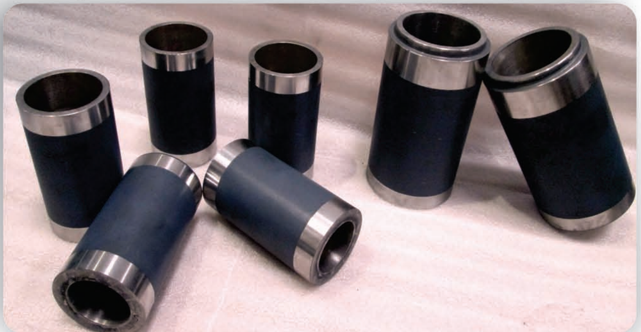
Ceramic Coated Pump sleeve