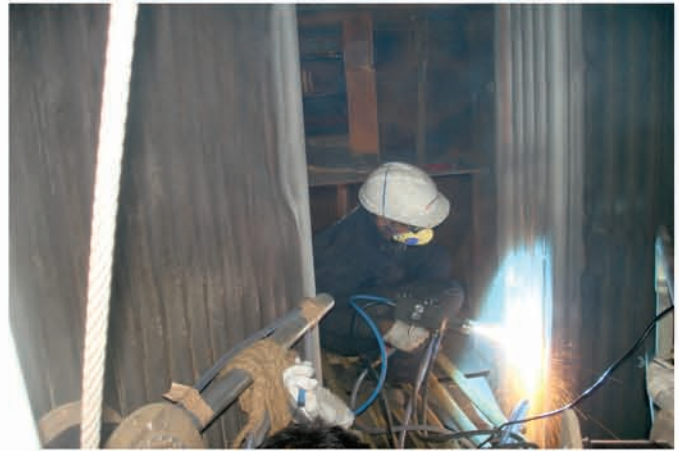
ARC Spray Coating on Burner Panel Tube