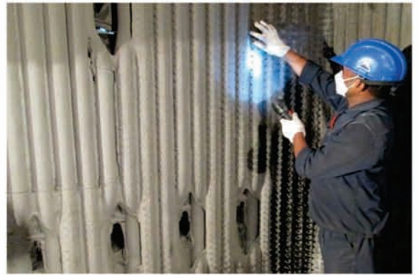
Coating Inspection by ATS