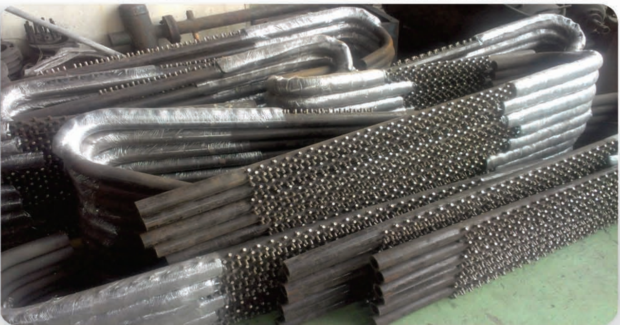
Coated Cend Tube of AFBC Boiler