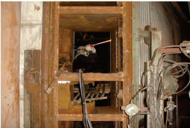
HVOF Coating on Burner Panel Tube