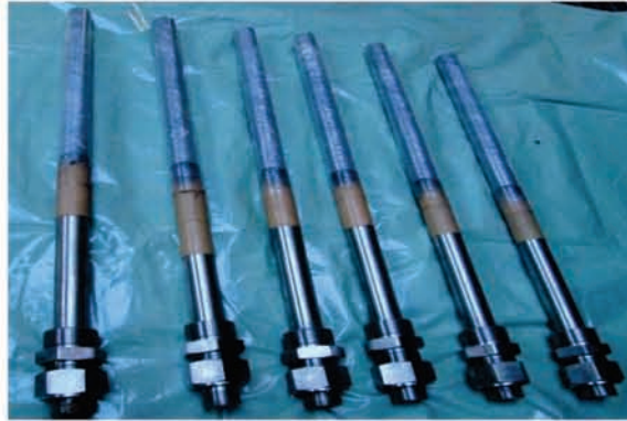
Coated Thermo Couples